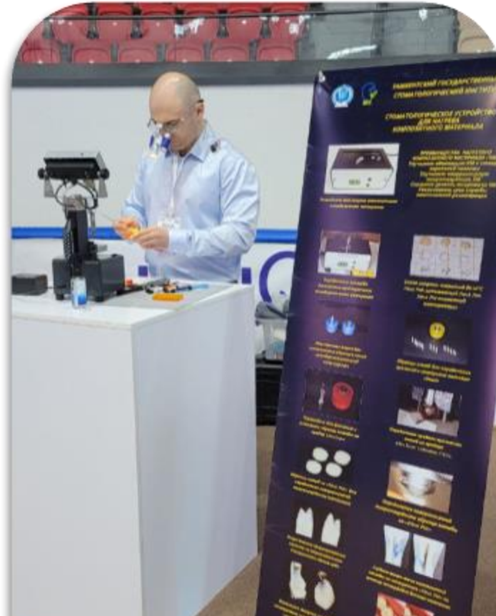
Active participation with innovations, devices in InnoWeek