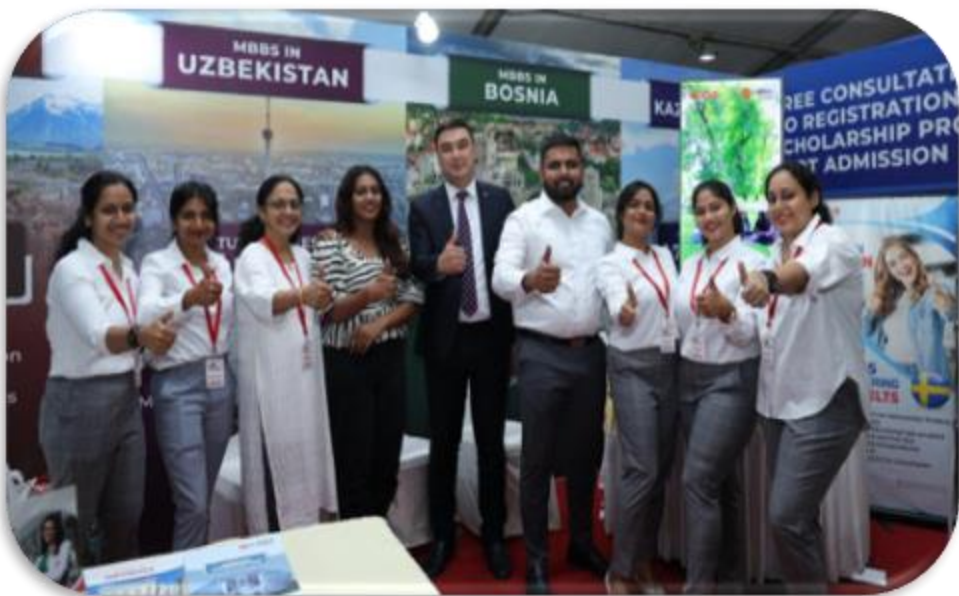
EXPO "Educational Process in Foreign Higher Education Institutions" (Kochi, India) https://www.tsd.uz/yangilik%5C244