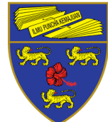
University of Malaya