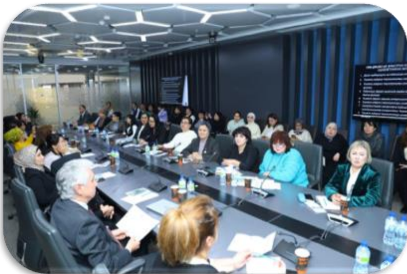
Republican scientific-practical seminar "Role of information-resource centers in higher education: experience, problems, prospects" https://www.tsd.uz/yangilik%5C378