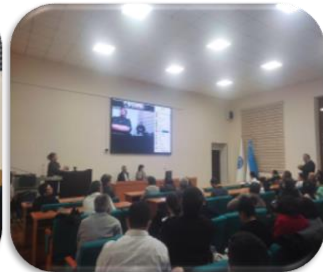
Seminar training on the organization of the credit module system https://www.tsd.uz/yangilik%5C164