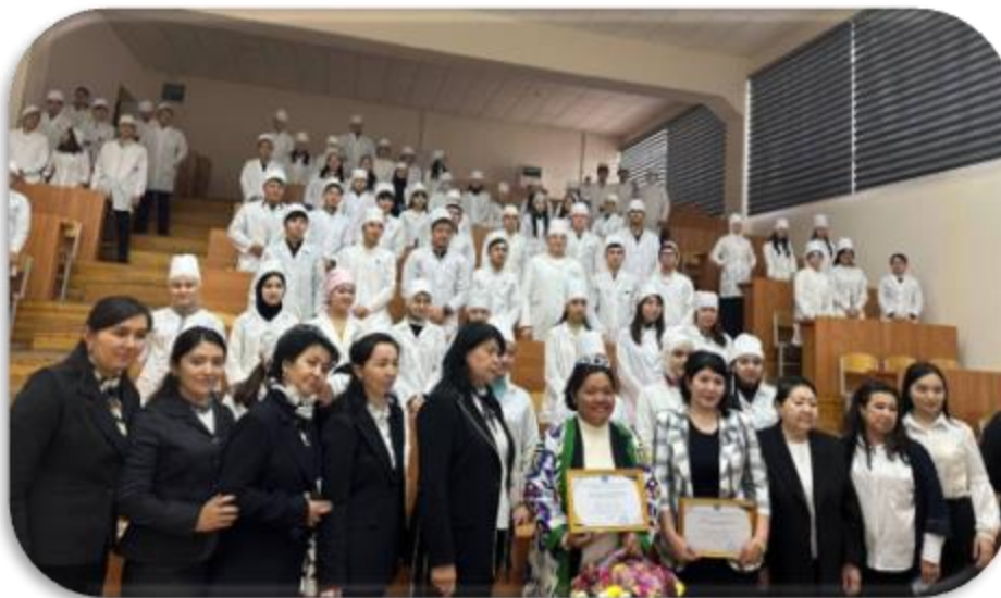
Seminar on teaching and learning foreign languages https://www.tsd.uz/yangilik%5C343