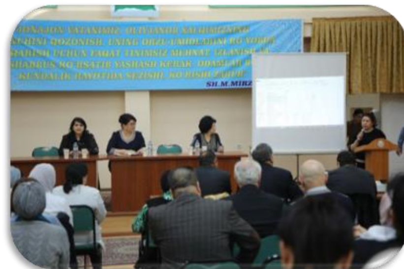
Teaching-methodological seminar "Our highest goal is to ensure the continuity and integrity of medical education" at technicum https://www.tsd.uz/yangilik%5C166