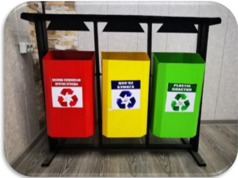
Separate waste collection