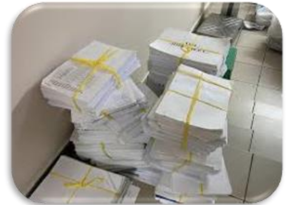
Waste paper collection campaigns