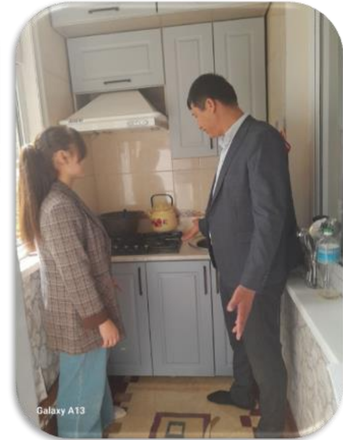
Regular visits to students' rent flats