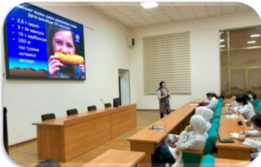
Regular seminars and trainings on health diet and rational nutrition