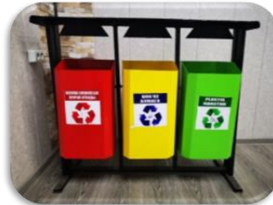
Separate waste collection