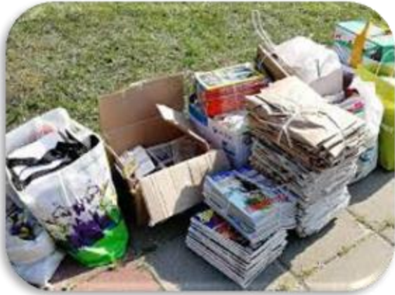
Waste paper collection campaigns